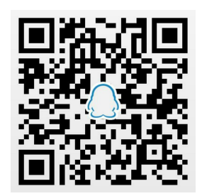
Exosome Research Exchange Group