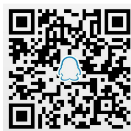
Exosome Research Exchange Group