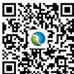
Wechat Public Platform

Ordering Information: order@rengenbio.com